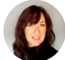
Ministry of Not-for Profits Board Directors