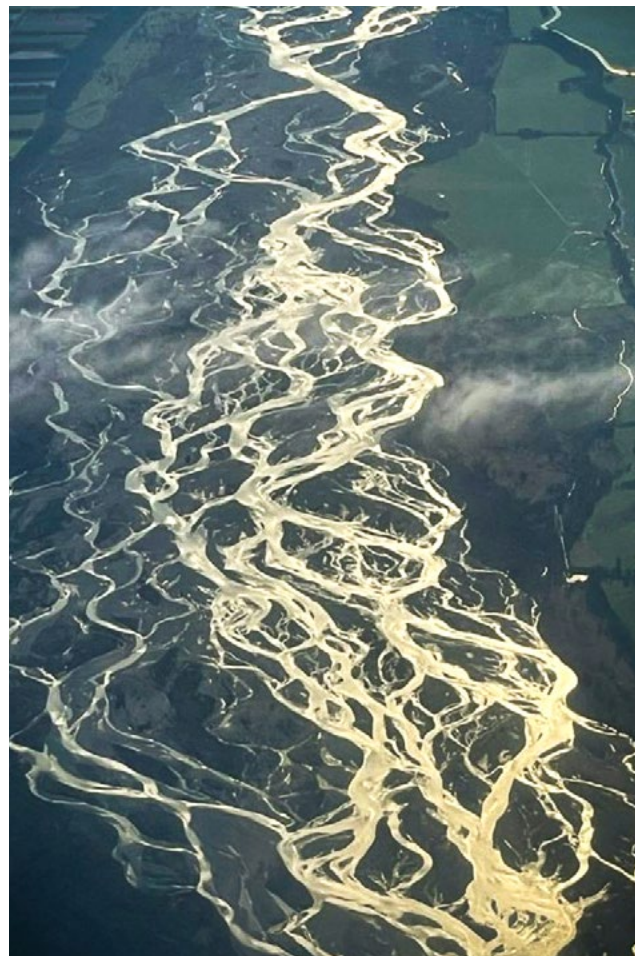
Image: The afternoon sun reflecting off the braided Rakaia River flowing out of Lake Coleridge, captured on a flight south to Queenstown.

Then the magic ingredient to really see new opportunities, is that you have to be willing to also let directions shift, like a braided river, and go where the water of new opportunities are flowing.